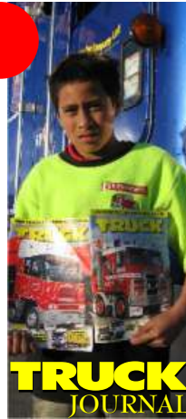
Preserving our history Promoting our future